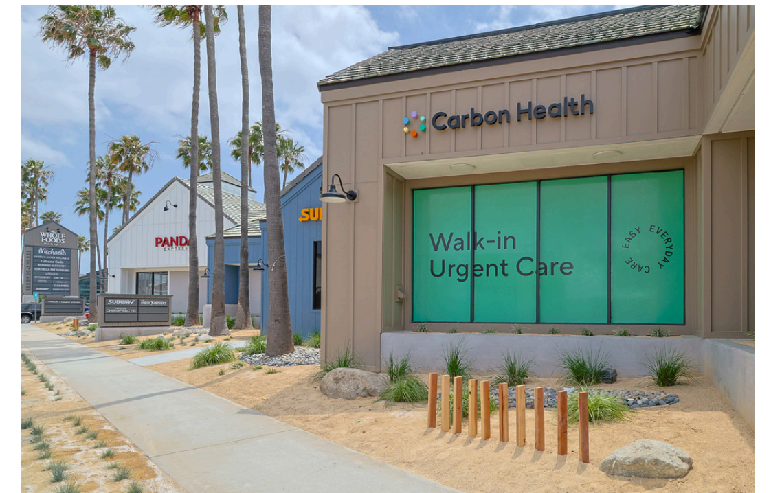
PROPERTY PHOTOS REDONDO SHORES SHOPPING CENTER

401-413 N. PACIFIC COAST HWY., REDONDO BEACH, CA 90277