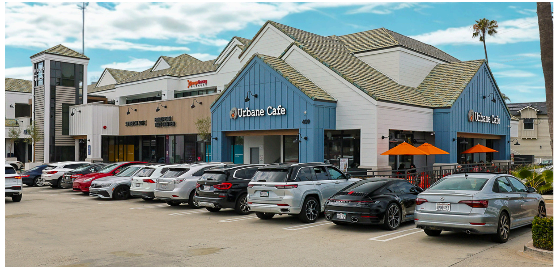
PROPERTY PHOTOS REDONDO SHORES SHOPPING CENTER

401-413 N. PACIFIC COAST HWY., REDONDO BEACH, CA 90277