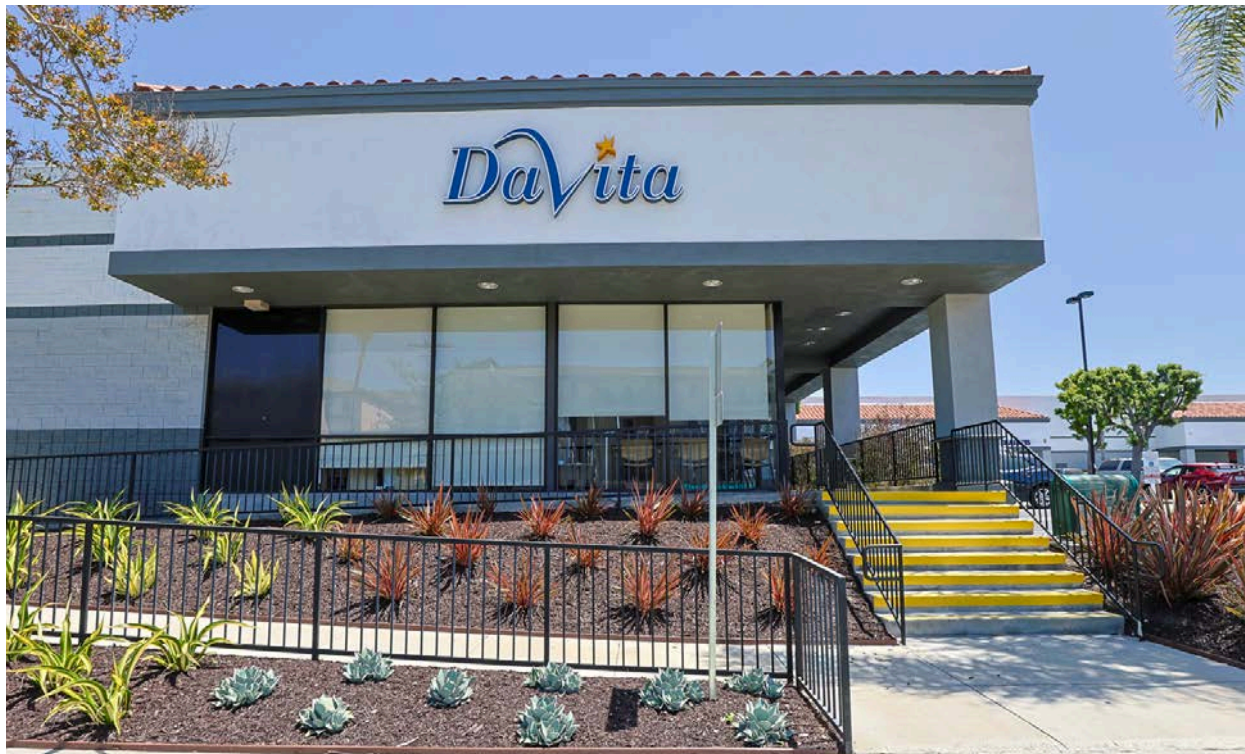
SITE PHOTOS SMART & FINAL SHOPPING CENTER

21600 - 21608 S. VERMONT AVE., TORRANCE, CA 90502