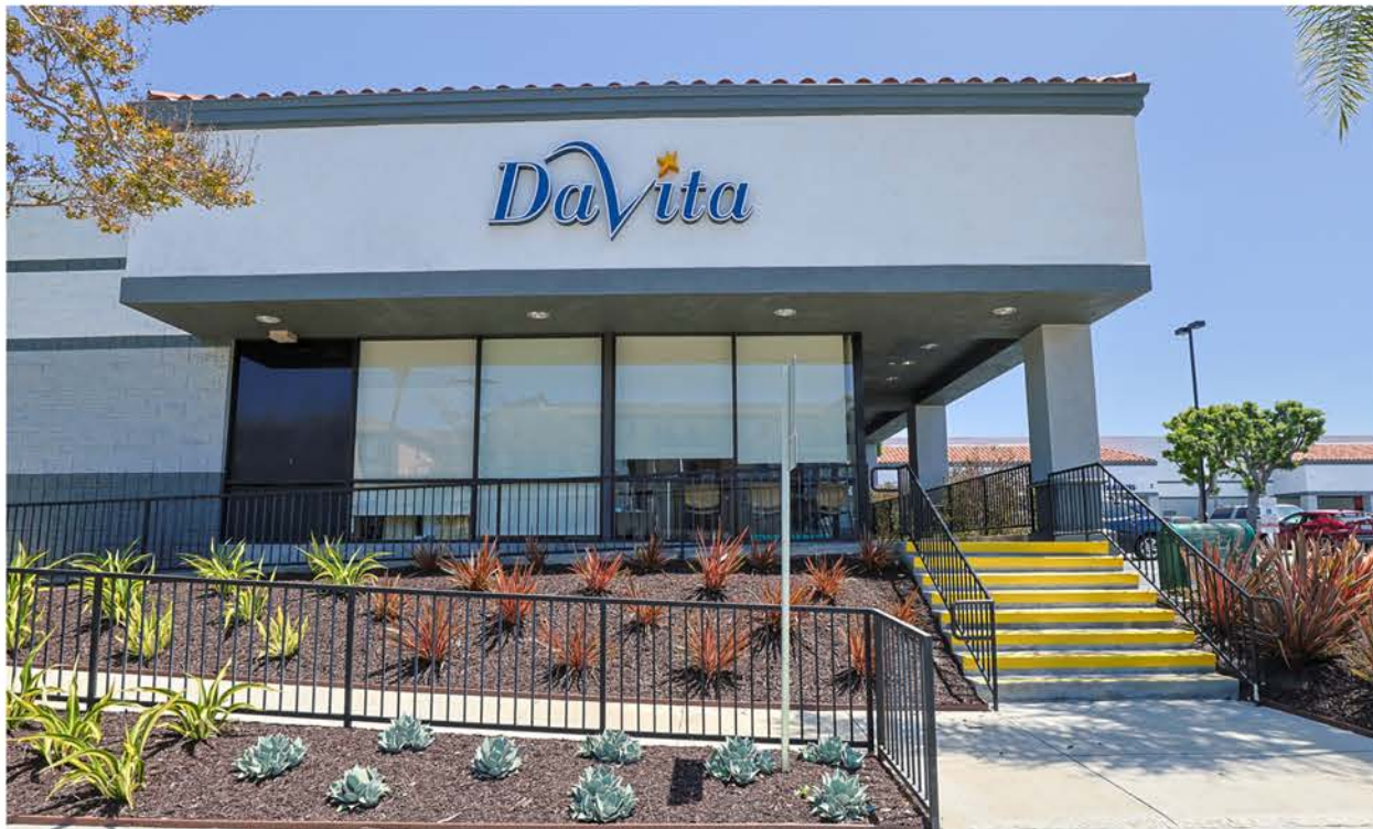
SITE PHOTOS SMART & FINAL SHOPPING CENTER

21600 - 21608 S. VERMONT AVE., TORRANCE, CA 90502