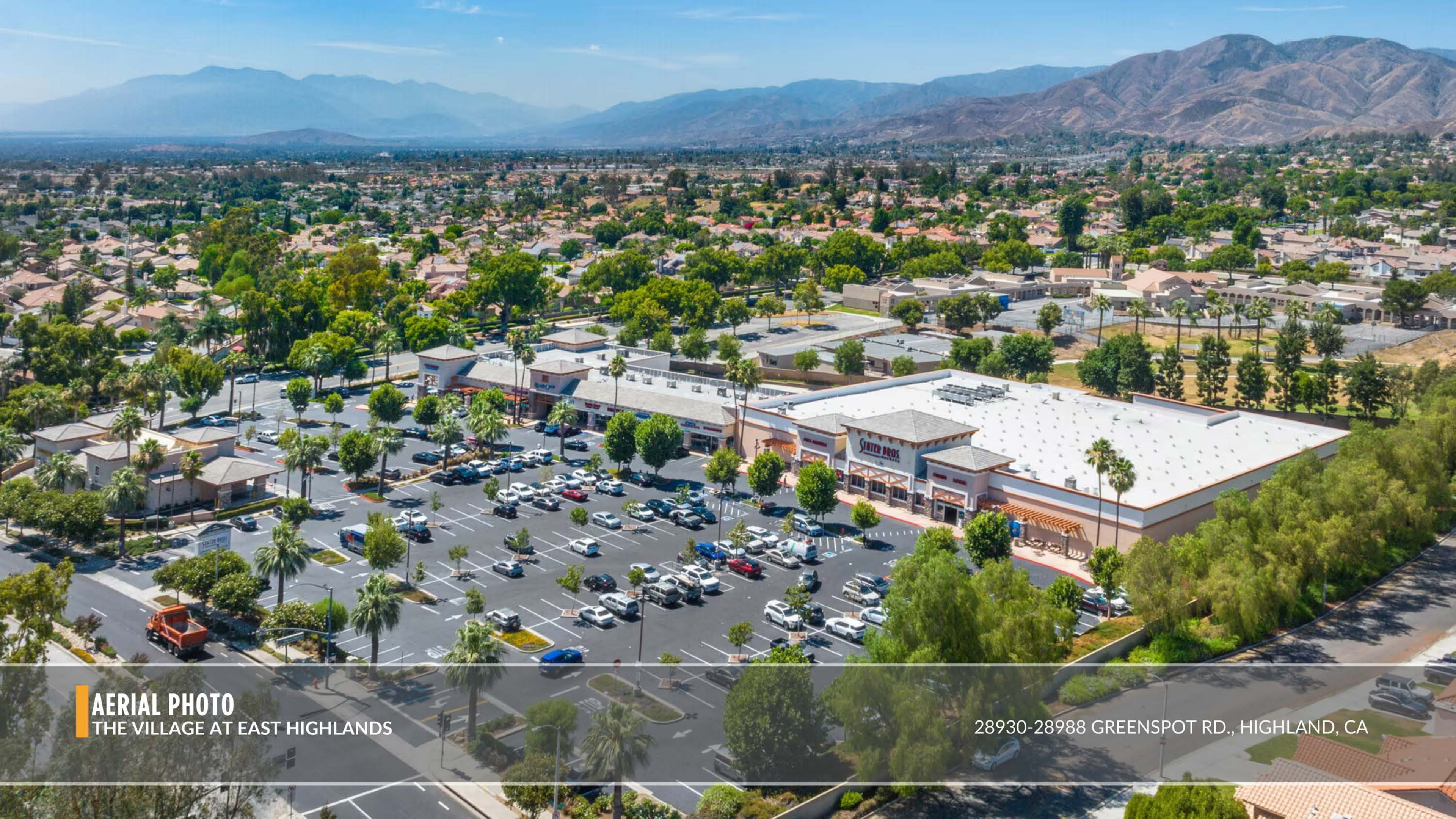
AERIAL PHOTO THE VILLAGE AT EAST HIGHLANDS