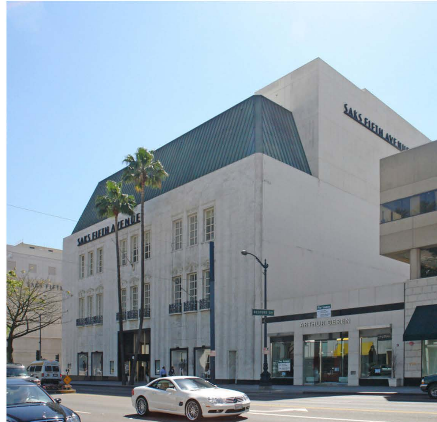
BUILDING PHOTOS SAKS FIFTH AVENUE BUILDING

9634 Wilshire Blvd., Beverly Hills, CA 90212