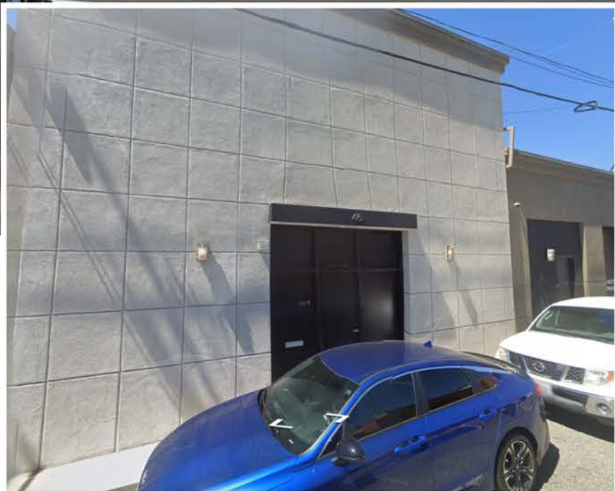
BUILDING PHOTOS INGLEWOOD WAREHOUSE