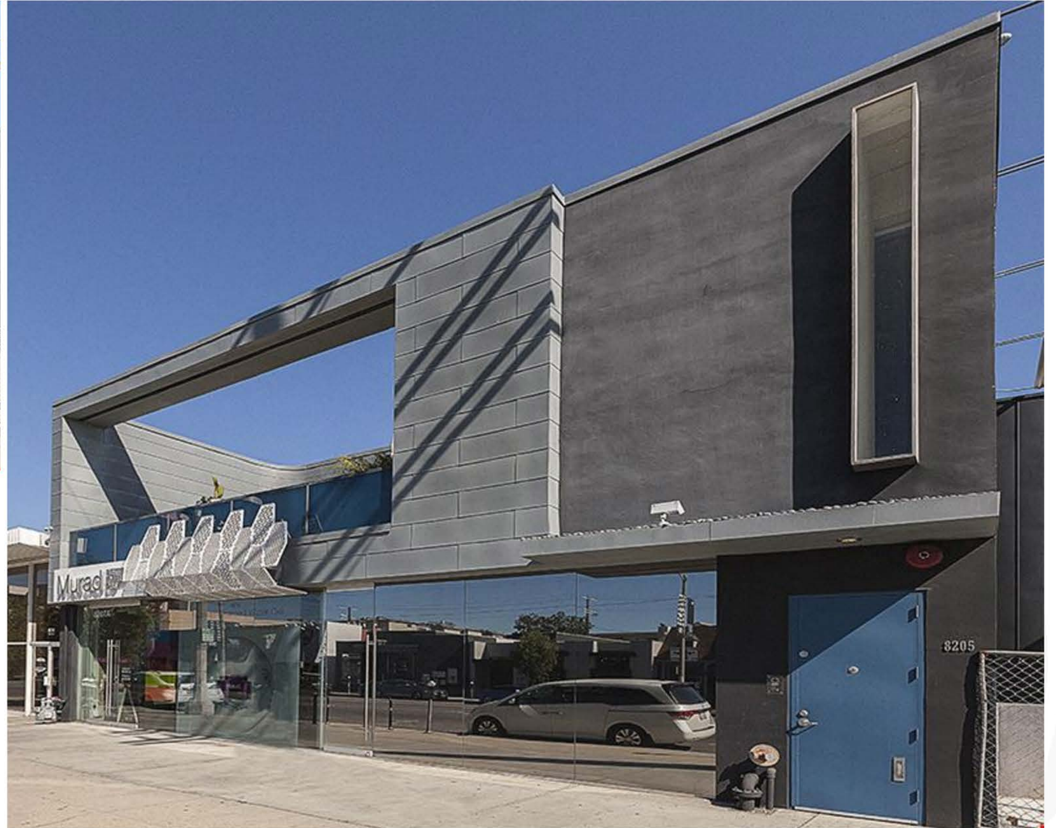
BUILDING PHOTO RETAIL STOREFRONT